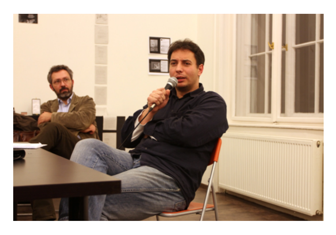
Moderated by András Müllner (ELTE Department of Media and Communication)